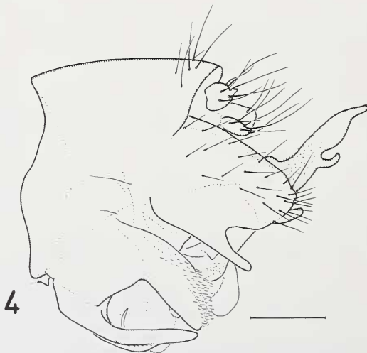
Figs 3-4: Plethysmochaeta males, left faces of hypopygia. 3, P. trinervis , 4, P. tripartita . (Scale bars = 0.1 mm).